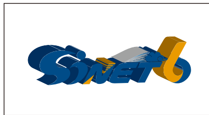
3D effects applied