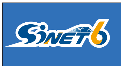
Overly thick white outline