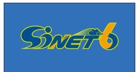
Color applied to the white outline