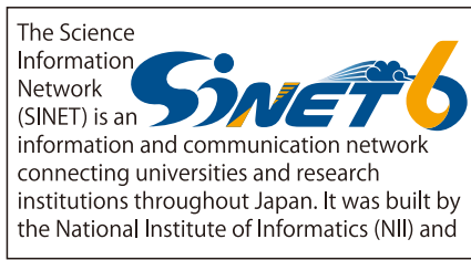
Isolation area not observed

Usage where the provided logo data has been deformed or manipulated is prohibited.