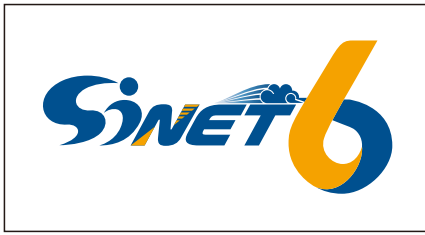
Only partially enlarged