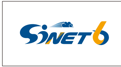
Altered positioning of elements